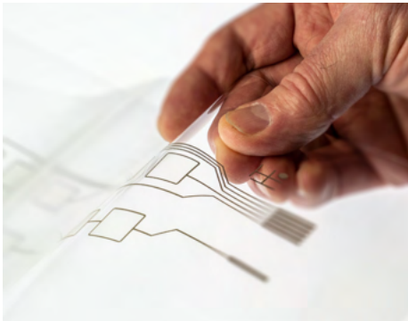
Transparent capacitive touch sensors made from AgeNT-75