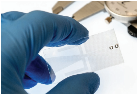
AgeNT-1 Film: Diamond pattern consists of 5\mu\text{m} lines of 2\mu\text{m} thick Cu having a 100\mu\text{m} pitch for ~ 85% open area