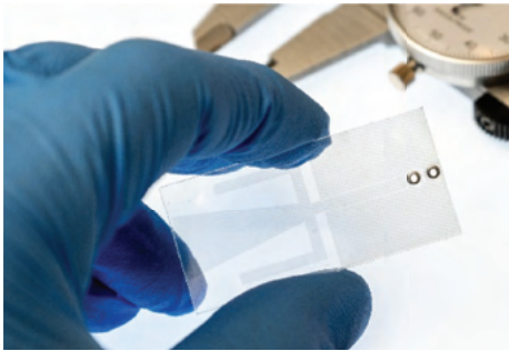
AgeNT-1 Film: Diamond pattern consists of 5\mu\text{m} lines of 2\mu\text{m} thick Cu having a 100\mu\text{m} pitch for ~ 85% open area